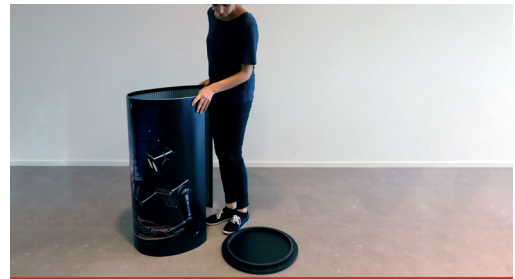
Now you can take the print off completely, and store the parts in the separate bags.