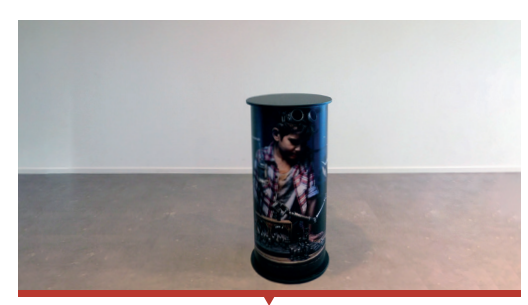
8. The counter is now ready to use, and can hold up to 60 Kg.