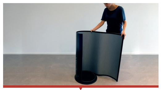
4. Attach the print until you're half way.