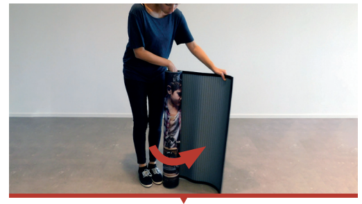
Make sure you roll up the wrap with the print on the outside, for longer durability.