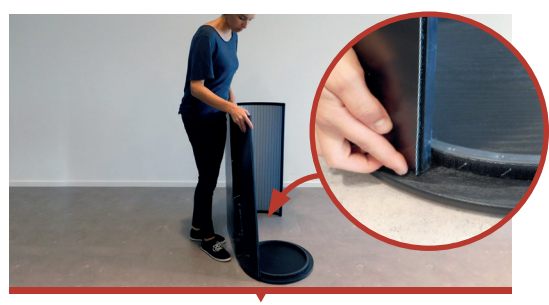
To attach the wrap, start at one side of the hook Velcro strip of the base.