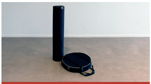
1. This counter is packed in 2 bags. One for the base 2. and tabletop, and one for the wrap (incl. print).