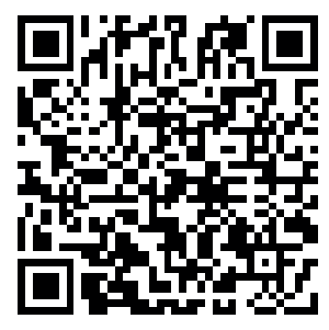
Scan for instructional video