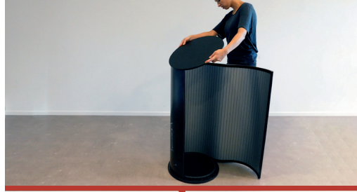
5. Then slide in the table top so it leans on the curve of the wrap, and the Velcro connects.